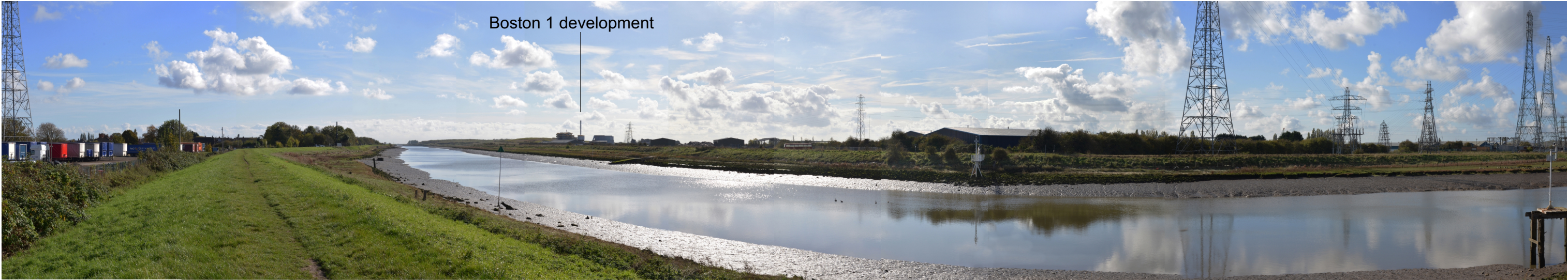
View 8: Looking south from Footpath Bost/13/3 near St Nicholas’s Church, Skirbeck Conservation Area and properties off The Featherworks / Skirbeck Gardens (E533779, N342990, 6mAOD, 169°, 260m from site boundary)