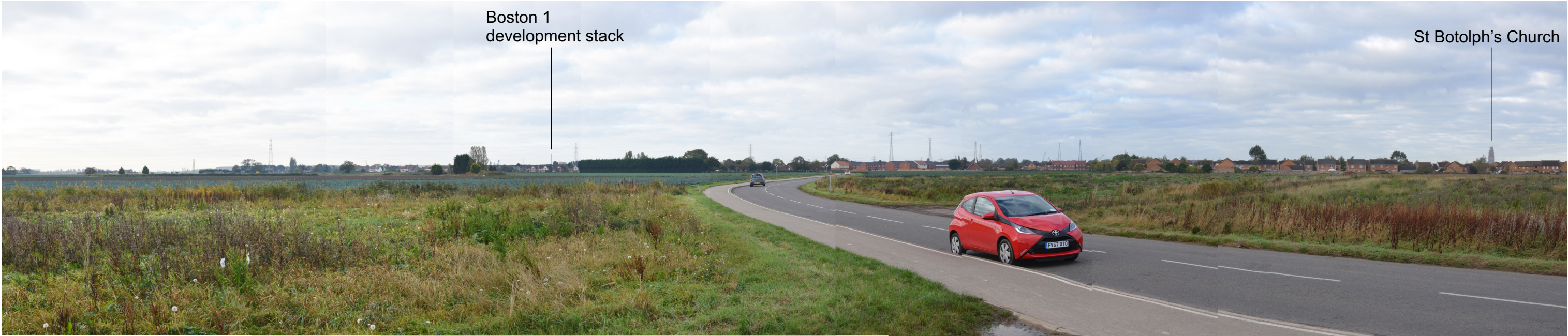
View 1: Looking south west from Toot Lane near Hawthorn Tree Primary School (E534991, N343686, 3mAOD, 212°, 1.5km from site boundary)