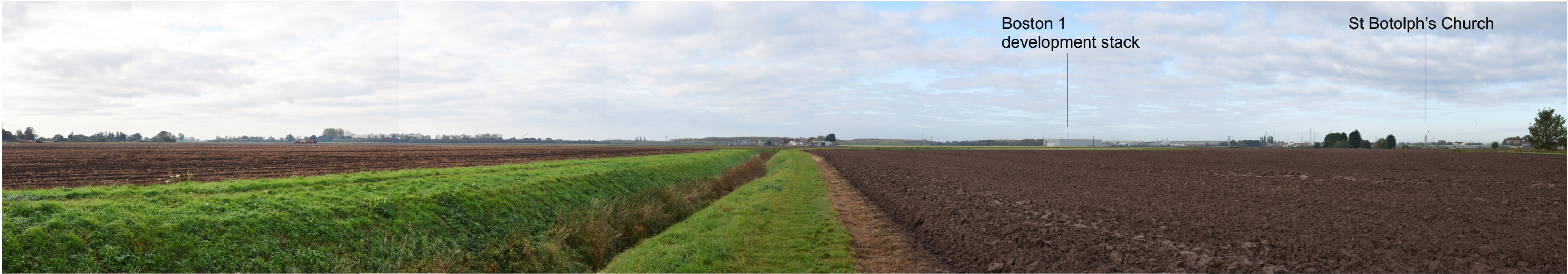
View 3: Looking west from Footpath (Fish/3/1) at Fishtoft (E536054, N342215, 3mAOD, 266°, 1.8km from site boundary)