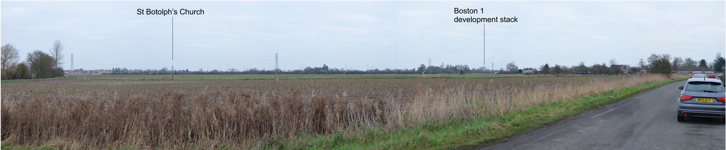
View 16: Looking north east from properties off Causeway (E532419, N340990, 3mAOD, 55°, 1.6km from site boundary)