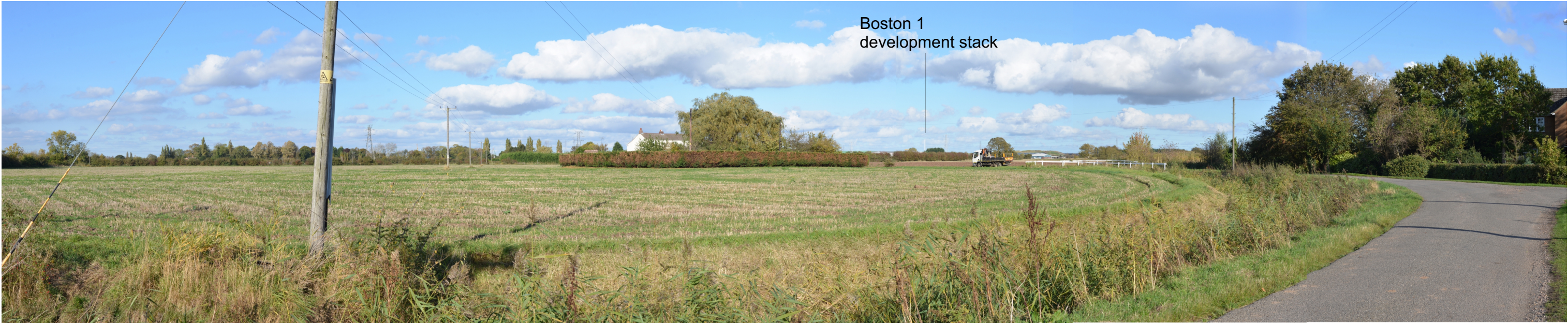
View 14: Looking north east from Church Lane at Wyberton Park near property Denemere (E533122, N340821, 3mAOD, 34°, 1.2km from site boundary)