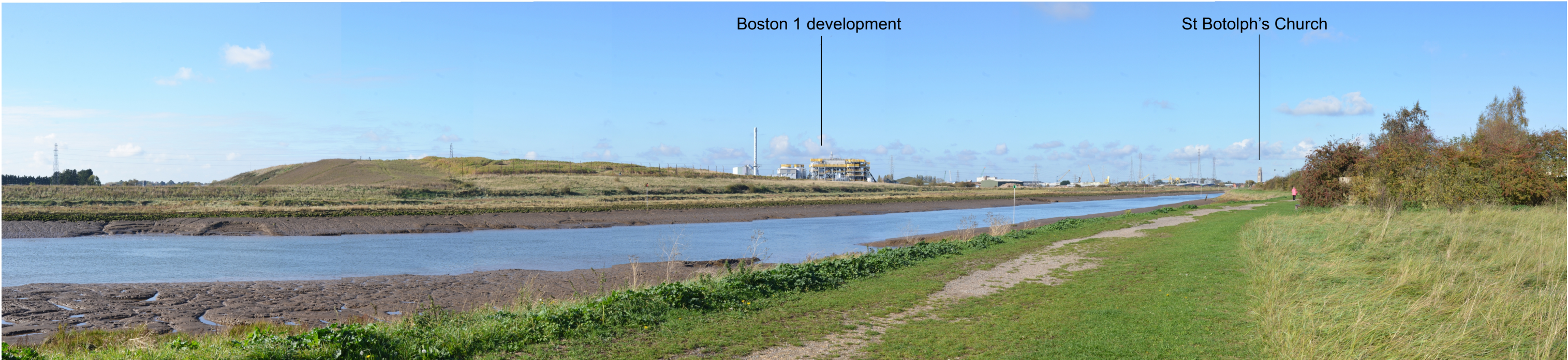
View 7: Looking north west from the junction of Footpaths Fish/13/2, Fish/13/5 and Fish/13/7 on the north bank of The Haven (E534628, N341961, 6mAOD, 278°, 500m from site boundary)