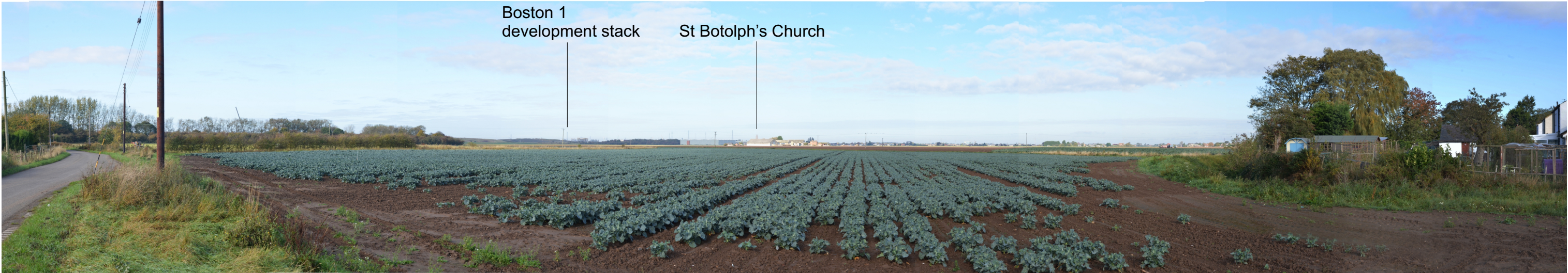
View 4: Looking north west from Scalp Road, near property Appleside (E536066, N341271, 3mAOD, 290°, 2km from site boundary)