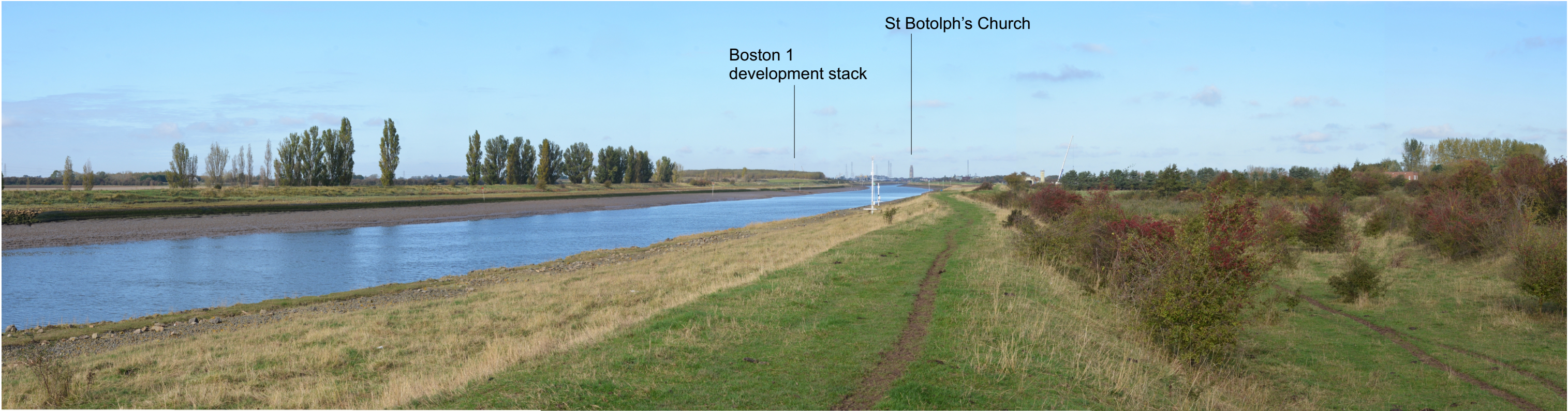
View 6: Looking north west from Footpath Fish/13/10 at junction with Footpath Fish/13/9 on the north bank of The Haven (E535841, N340453, 6mAOD, 310°, 2.2km from site boundary)