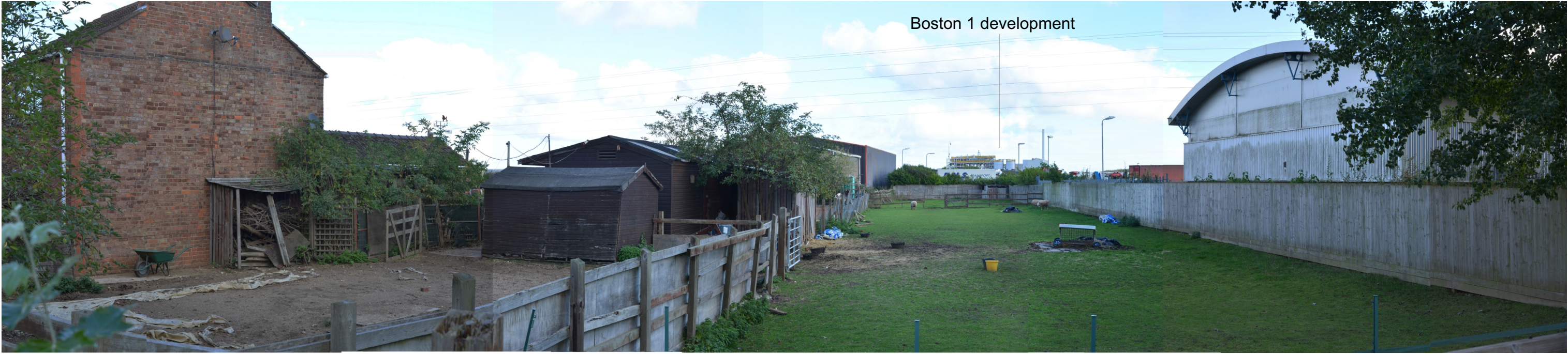
View 10: Looking east from Marsh Lane near property Cremorne and opposite property Coronation Villa (E533523, N341992, 3mAOD, 82°, 230m from site boundary)