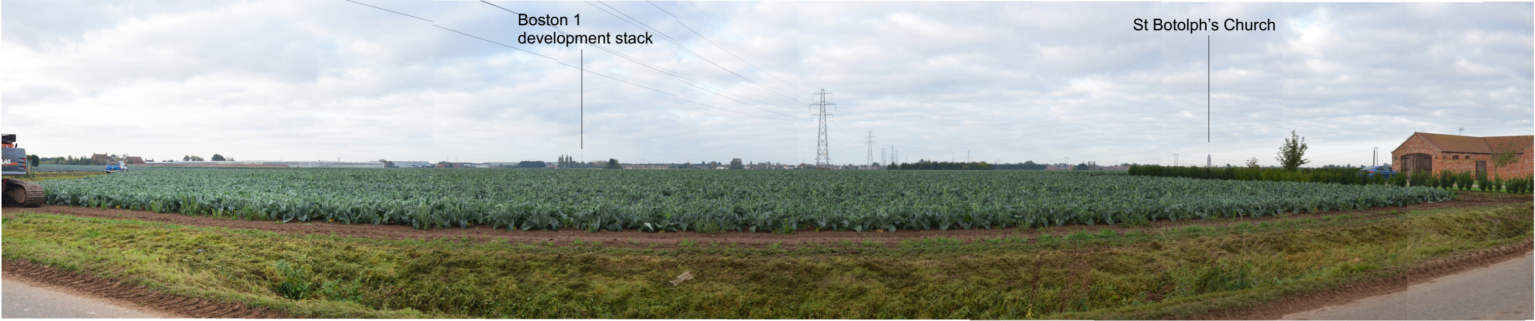
View 2: Looking south west from Church Green Road near Fishtoft (E535814, N343277, 2mAOD, 237°, 1.8km from site boundary)