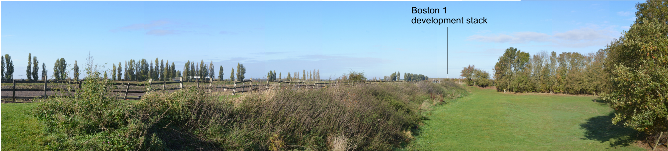
View 5: Looking north west from the Pilgrim Fathers Memorial to the north of The Haven (E536082, N340195, 6mAOD, 311°, 2.5km from site boundary)