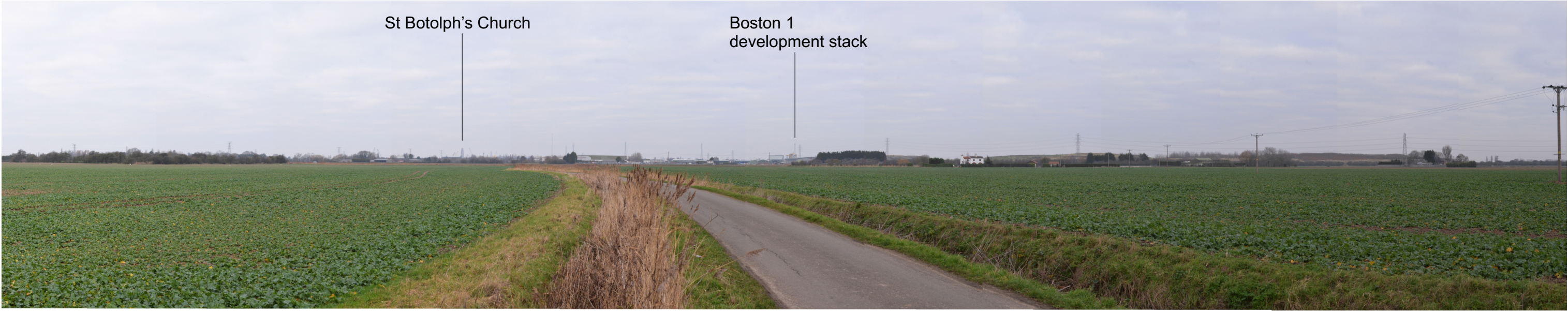
View 15: Looking north from near properties off Rowdyke Road (E533926, N340695, 3mAOD, 1°, 1.1km from site boundary)