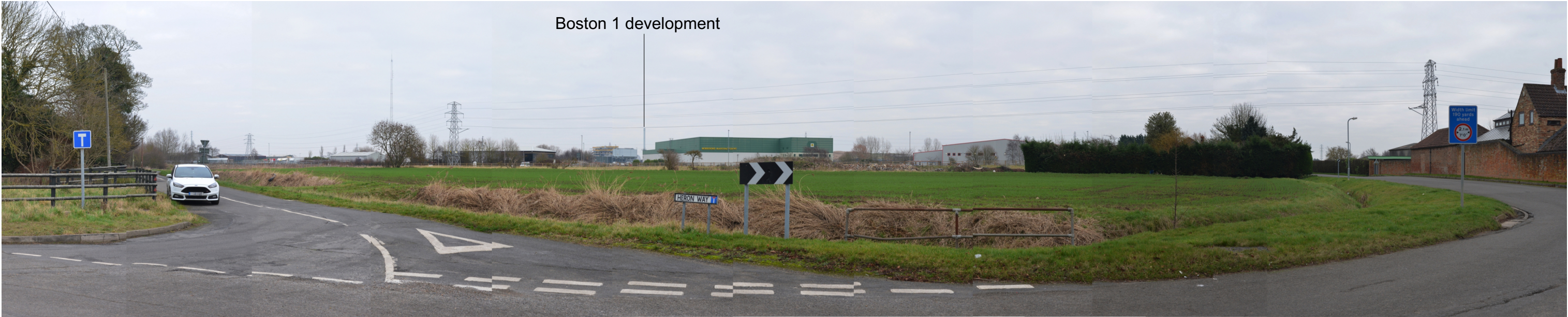
View 12: Looking north east from junction of Crosshill Lane and Slippery Gowt Lane (E533435, N341642, 3mAOD, 72°, 445m from site boundary)