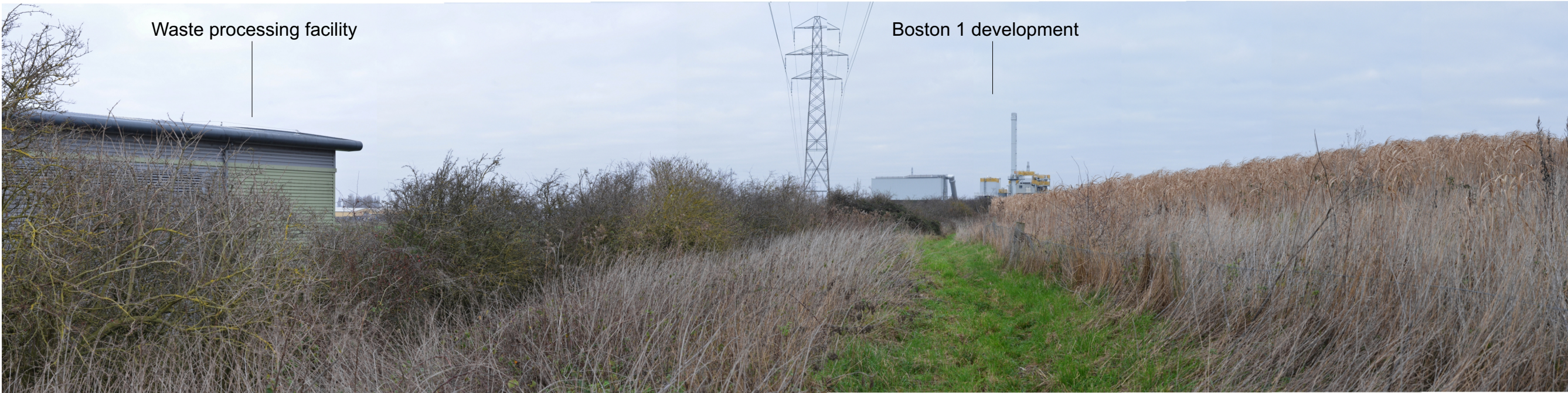
View 9: Looking north from Footpath Bost/14/8 (E534135 N341740, 6mAOD, 327°, 67m from site boundary)