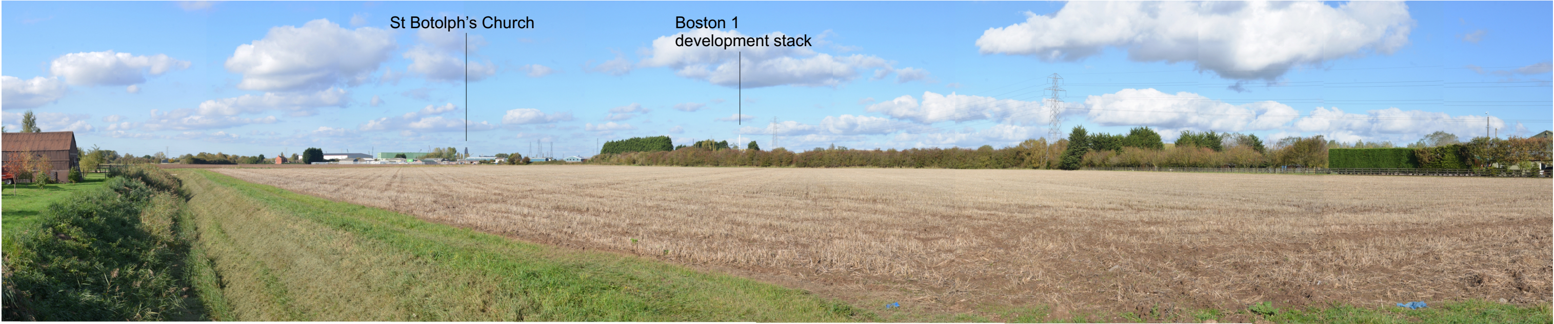
View 13: Looking north from Silt Pit Lane near property Silt Pit Farm (E534190, N341034, 3mAOD, 347°, 780m from site boundary)